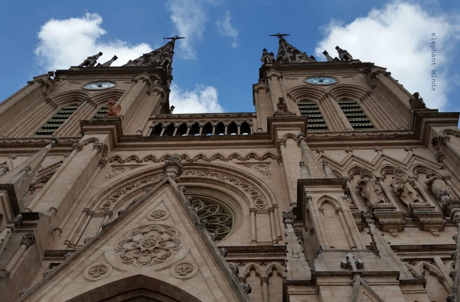
— Catedral de Luján