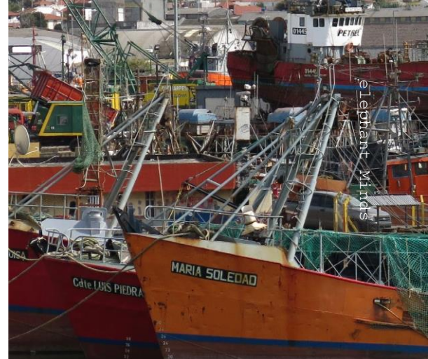
Puerto en Mar del Plata

enjoy a quiet boat ride on its waters or walk along its banks. Lobos is also known for being the birthplace of Juan Domingo Perón, former President, a site that history buffs may choose to visit.