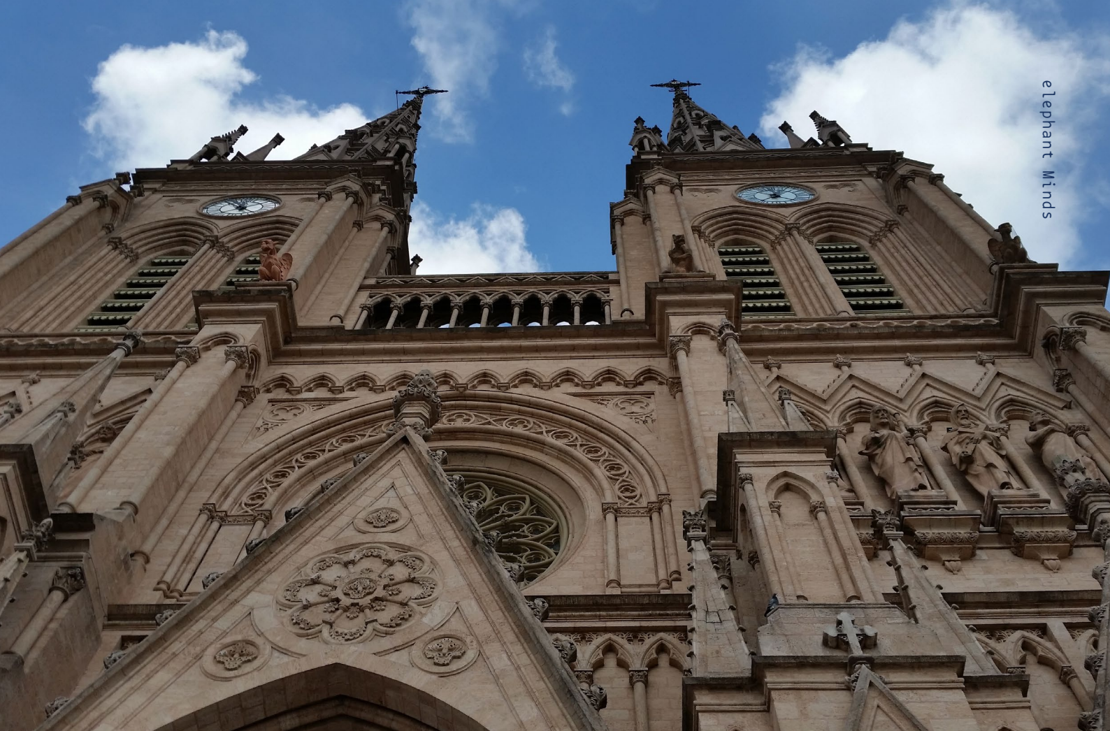
^ Catedral de Luján